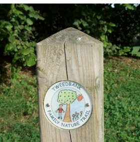
1. Tweedbank Family Nature Trail 2. Walkit walks at Gunknowe Loch 3. Tweedbank Park 4. Tufted Duck.